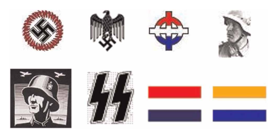
FIGURE 1 Avatars used to express an extreme right identity online.

Now that it is clear that members of Stormfront are characterized by a deeply entrenched extreme right-wing ideology they propagate online, we discuss the participants' experiences relating to their extremist identity in offline social life.